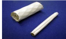
Covered CP Stents

The Covered CP Stent is composed of heat treated metal (90% platinum and 10% iridium) wire that is arranged in laser welded rows with a “zig” pattern. The number of rows determines the unexpanded length of the stent. The ePTFE covering is then attached to the metal wire frame.